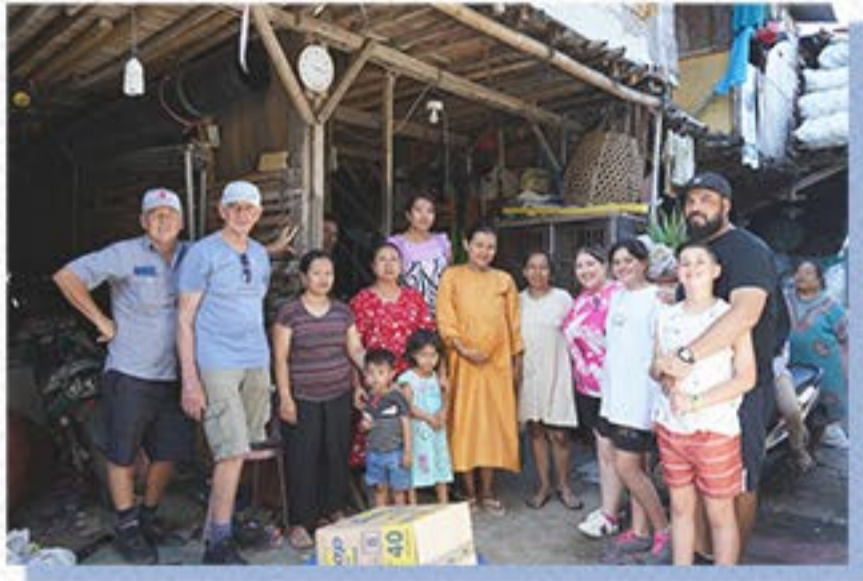
Food Distribution Denpasar Mums

I had the privilege of travelling with Team Bali 2023 to the Bali Life Foundation, where I encountered what many would consider the best and worst of Bali. I witnessed the poverty of trash-sorting communities who have constructed homes and a way of life on the small plots of land they were given, using whatever materials were available. I also heard stories of unimaginable trauma.